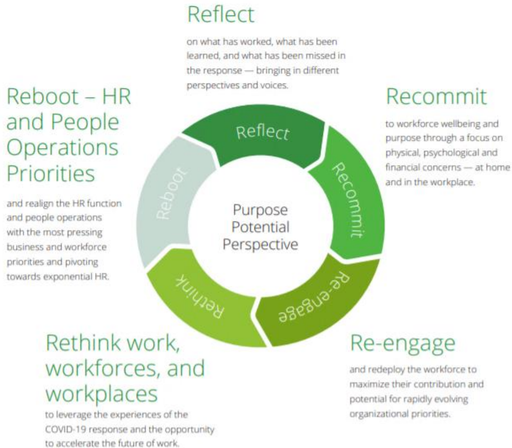
Figure 1. Deloitte