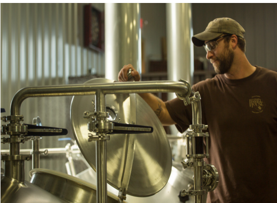
Blue Mountain Brewery opened in 2007 as the first brewery in Nelson County.